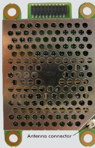
Antenna connector type U.FL