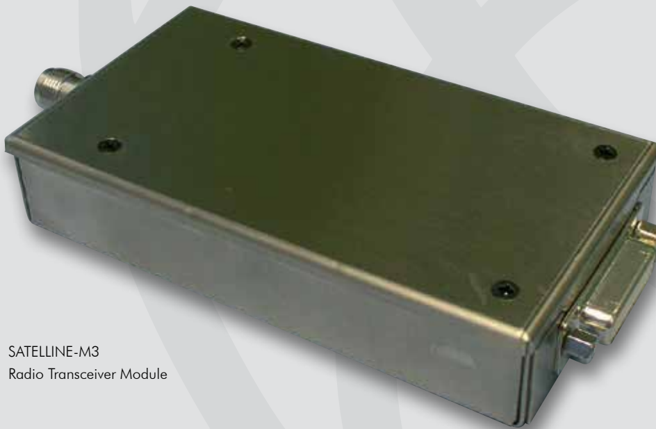
SATELLINE-M3 Radio Transceiver Module

SATEL Oy keeps developing and extending the list of transceiver module options. For the latest information, please visit our website or contact us or our local representative.